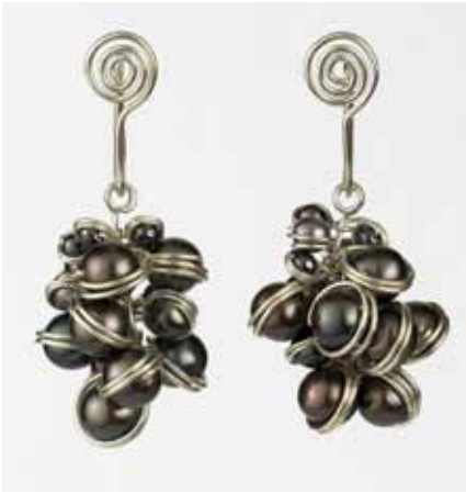
Rolled Flower Earrings - Black Pearls and Hematite

Rolled Flower Earrings measure 1 1/2" in length.