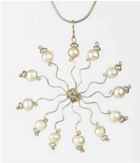
Snowflake Pendant - White Pearls