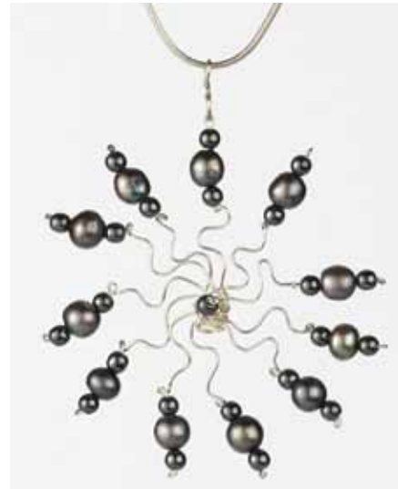
Snowflake Pendant - Black Pearls and Hematite