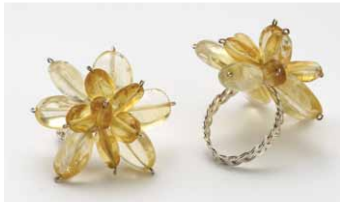
Daisy Ring - Citrine