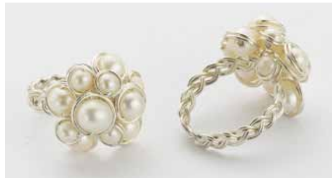
Rolled Flower Ring - White Pearls