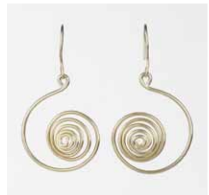
Yin / Yang Earrings