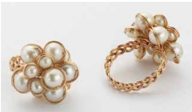
Rolled Flower Ring - White Pearls - 14K Red Gold