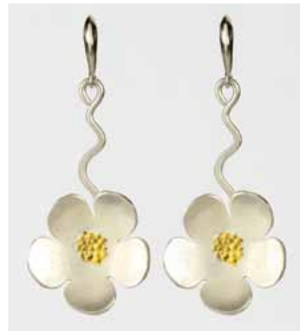
DG Flowers - Small Earrings