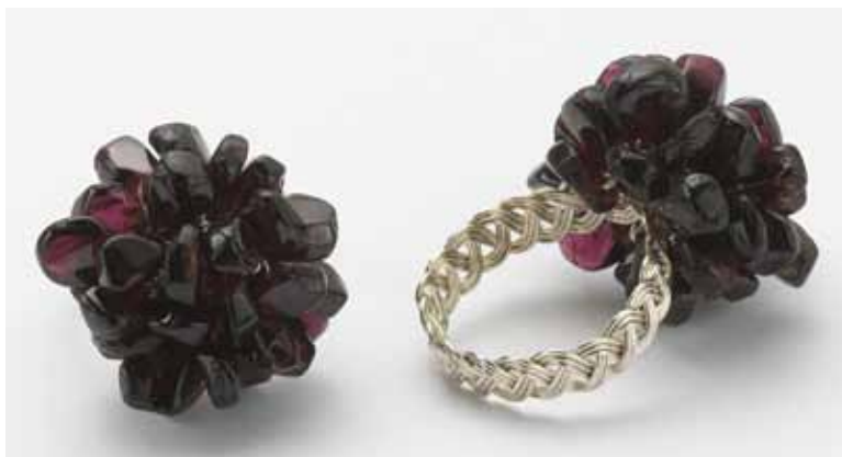
Berry Ring - Garnet