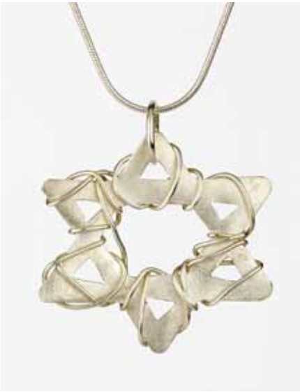
Star of David