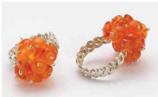
Berry Ring - Carnelian

Carnelian Berry Earrings measure 5/8" in width and 1 ¼" in length.