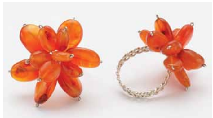
Daisy Ring - Carnelian