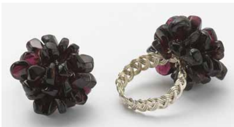
Berry Ring - Garnet