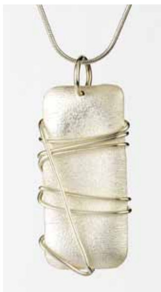
Flat Pendant - Rectangular