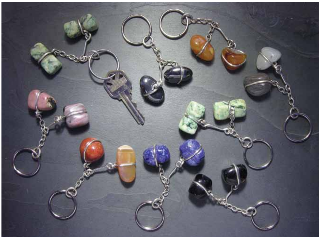
Key Chains - from left to right - Top: Jadeite, Hematite, Carnelian, Rutilated Quartz Key Chains - from left to right - Bottom: Rhodolite, Carnelian, Lapis, Smoky Quartz. Other stones available on request. Sterling silver chain and wrap and steel split ring.