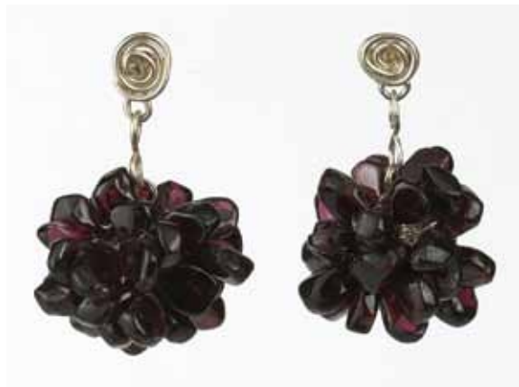
Berry Earrings - Garnet