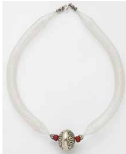
Mesh Choker - Asian Silver Bead