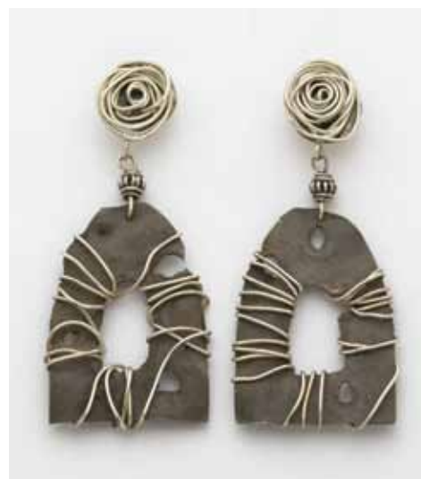
Oxidized Window Earrings