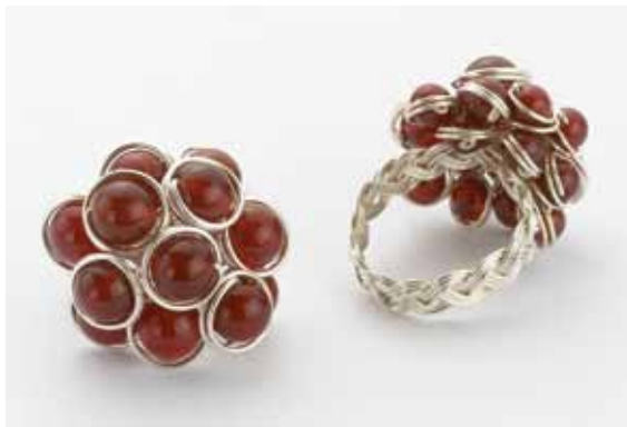
Rolled Flower Ring - Carnelian