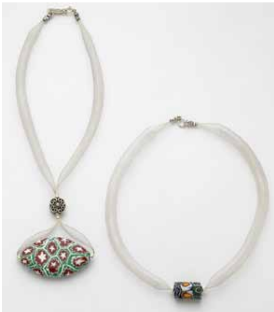
Mesh Choker - 1920's Murano Bead and Trade Bead