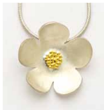
DG Flowers - Small 1F Pendant