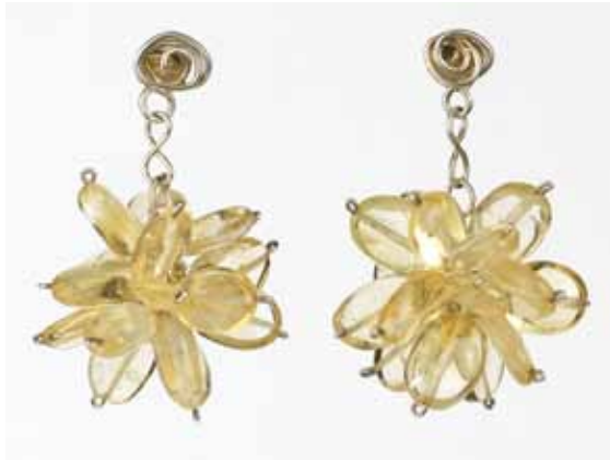
Daisy Earrings - Citrine

Diamond Cut Ring top measures 1" to 1 ¼".