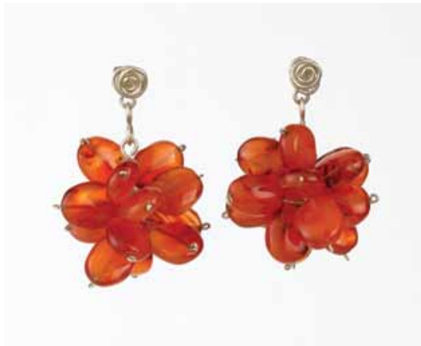
Daisy Earrings - Carnelian