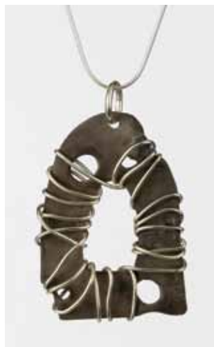
Oxidized Window Pendant