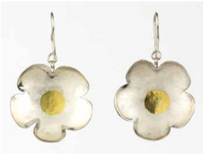
DG Flowers - Large Earrings

DG Flowers - Small Earrings measure 1 ¾ in length.