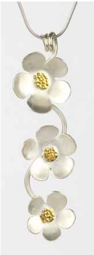
DG Flowers - Small 3F Pendant