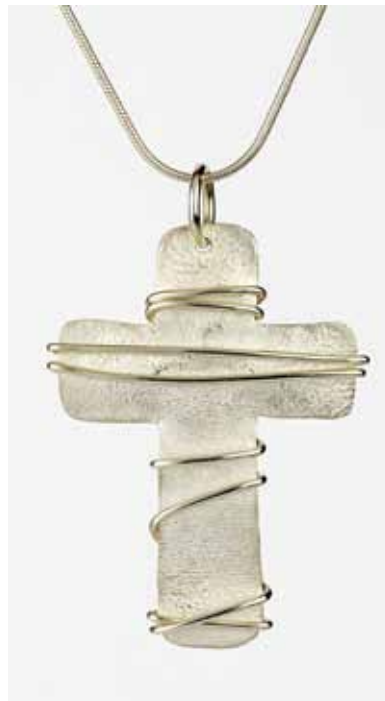
Flat Wrapped Cross