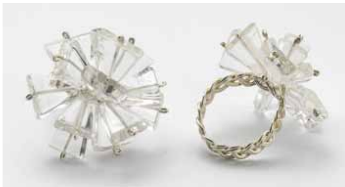
Diamond Cut Ring - Clear Quartz