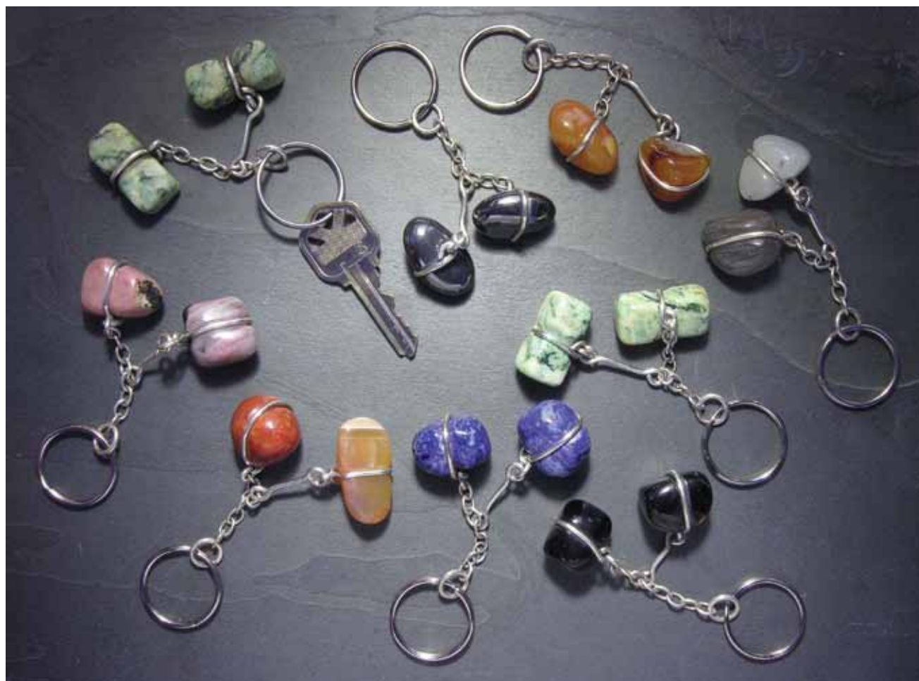
Key Chains - from left to right - Top: Jadeite, Hematite, Carnelian, Rutilated Quartz Key Chains - from left to right - Bottom: Rhodolite, Carnelian, Lapis, Smoky Quartz. Other stones available on request. Sterling silver chain and wrap and steel split ring.