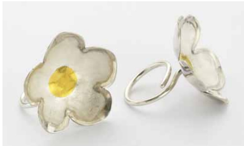
DG Flowers - Rings