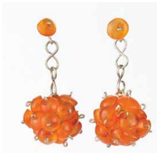
Berry Earrings - Carnelian