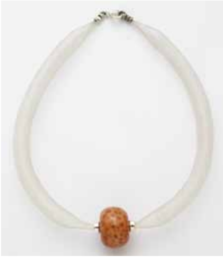
Mesh Choker - Round Carnelian

Carnelians, Asian, and Murano Glass Beads