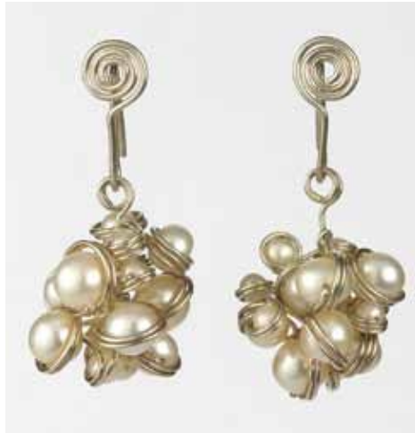
Rolled Flower Earrings - White Pearls