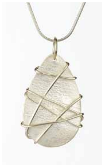
Flat Pendant - Drop

Flat Pendants and Window Pendants vary from 1 1/4" x 2" to 1" x 1 1/4"