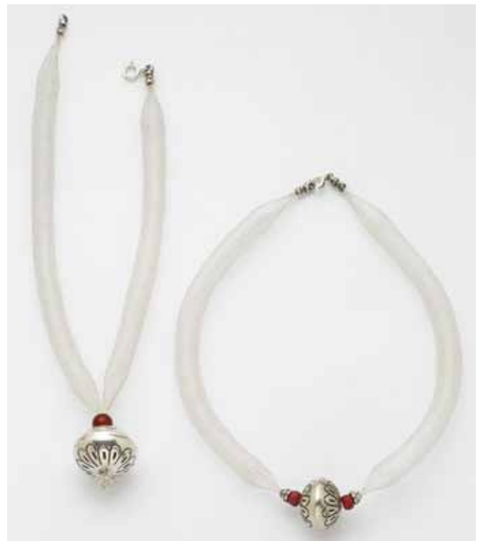
Mesh Choker - Asian Silver Beads