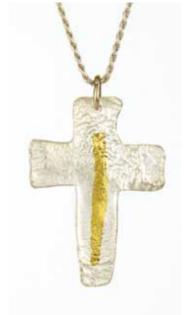
Small Flat Cross