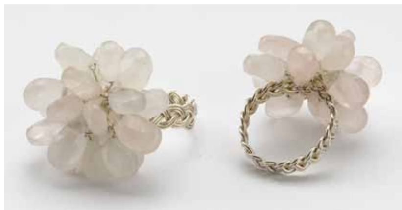
Berry Ring - Rose Quartz