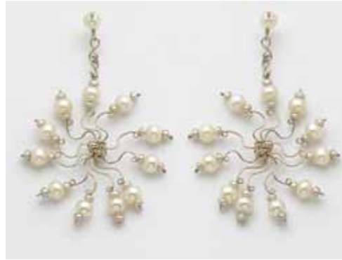
Snowflake Earrings - White Pearls

Snowflakes Pendant measures 2 ½" in diameter.