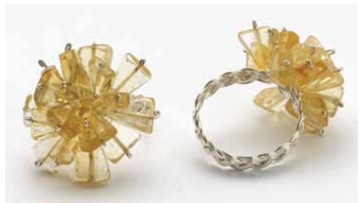
Diamond Cut Ring - Citrine