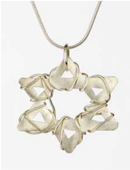
Star of David