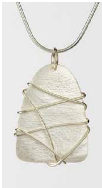
Flat Pendant - Round-Top Drop

Japanese Earrings measure 2" in length x 1 5/8" in width.