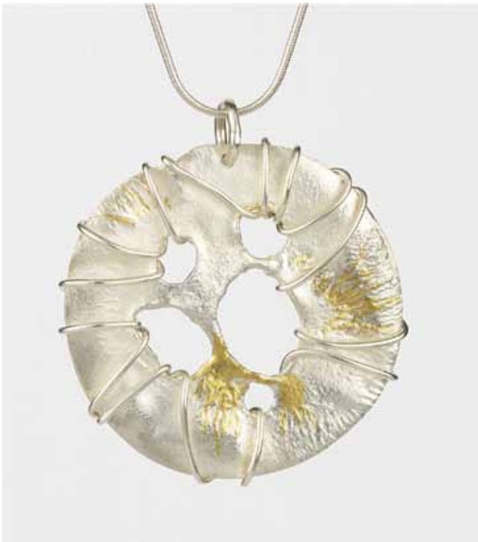
Things Happen for a Reason - Round Wrapped