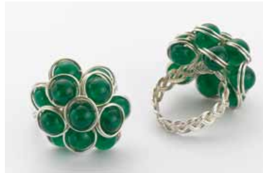
Rolled Flower Ring - Green Agate