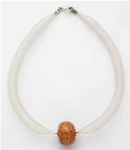
Mesh Choker - Round Carnelian

Carnelians, Asian, and Murano Glass Beads