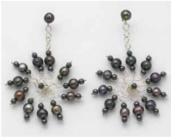
Snowflake Earrings - Black Pearls and Hematite

Multicolor Chandelier Earrings measures 2 ¼" in length.