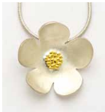
DG Flowers - Small 1F Pendant