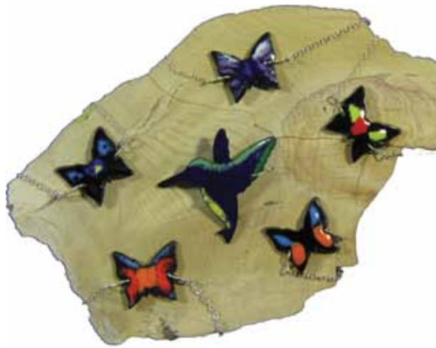
Hummingbird and Butterflies

The size of the "Tattoo" varies from 1" to 1 1/2".