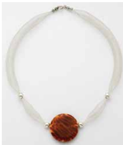
Mesh Choker - Flat Carnelian