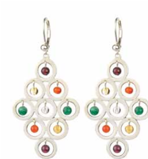
Multicolor Chandelier - Earrings (Garnet, Citrine, Carnelian, Green Agate, Clear Quartz)