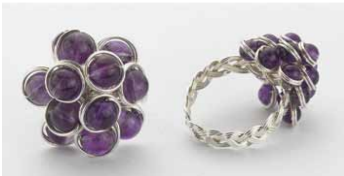
Rolled Flower Ring - Amethyst