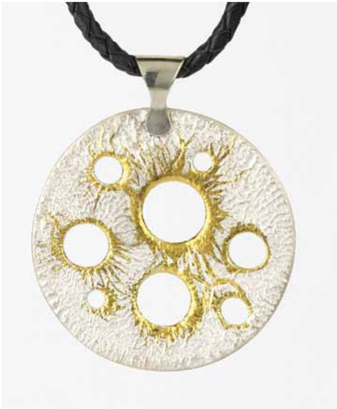
Things Happen for a Reason - Round