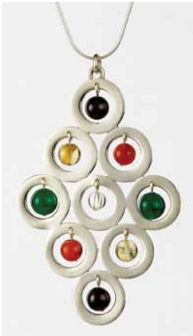
Multicolor Chandelier - Pendant